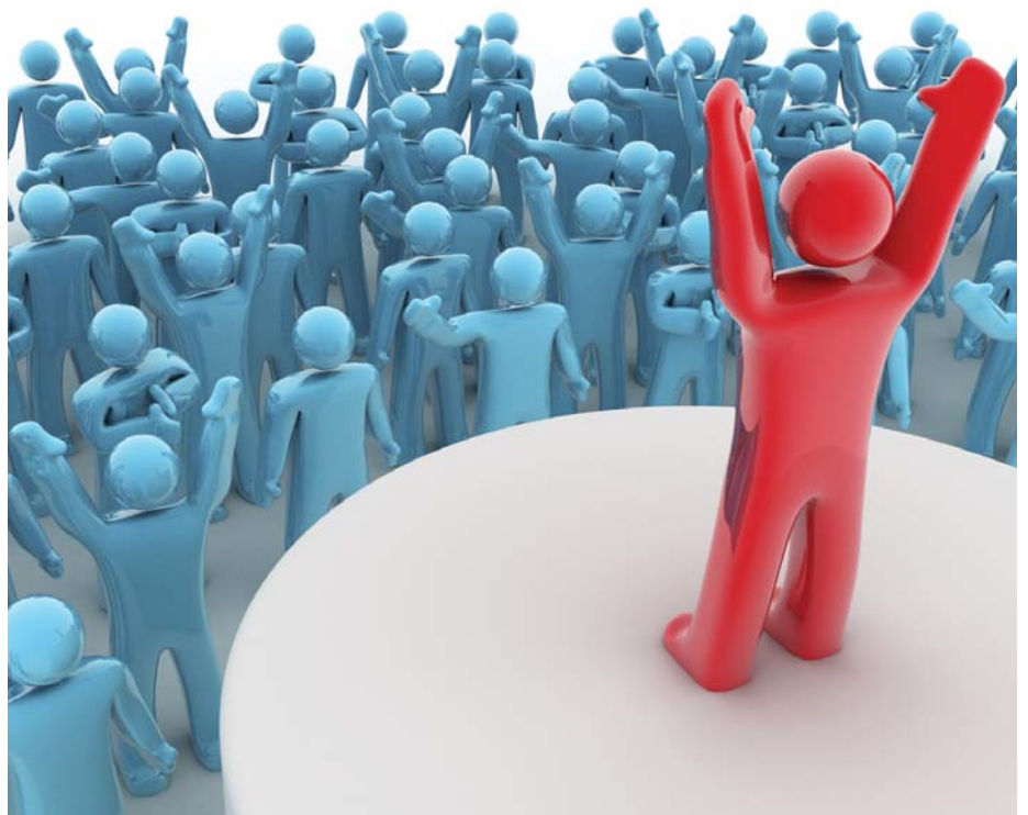
The process of interpersonal influence is more complex than many marketers may want to believe

Gladwell used this to illustrate the importance of social connectors. However, while a replication of the experiment by Watts and colleagues roughly confirmed the 'six degrees' hypothesis, they found that only about 5% of messages passed through highly connected individuals (8). Instead, their results pointed to the importance of a well-known network